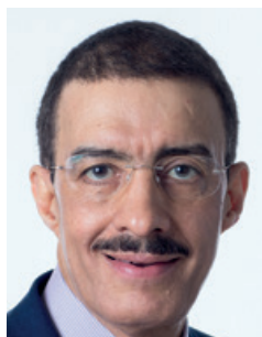
▲ His Excellency the IsDB President, Bandar M.H. Hajjar.

Hajjar, president of IsDB mentioned the achievements obtained by South Korea, Myanmar, Singapore and Rwanda through science diplomacy initiatives and high standards for quality of education. “Many other problems such as climate change cannot be solved by individual countries: they need cooperation,” he urged.