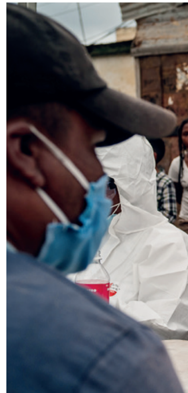
▼ Health workers deal with the COVID-19 pandemic in Madagascar.

"Already, to fight Ebola there was this education that people should avoid touching corpses and people who are infected, so this idea of isolation was already there in the population. So people, they are prepared,"