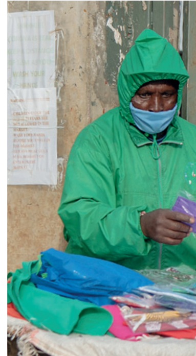
▲ A seller and customer wear masks during the COVID-19 pandemic in Kenya.

Dengue plagues more than 100 countries in the world, causing 100 million severe infections and 22,000 deaths per year. Zika infections are particularly dangerous to pregnant women, and no vaccine is currently available, and it is still a