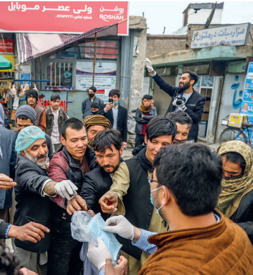
◀ An Afghan volunteer health worker distributes free face masks in downtown Kabul, Afghanistan.

▣▣ Collaboration can influence several areas — involving women, young entrepreneurs, professors, and cross any type of barrier, nationality, status and experience. ▣▣