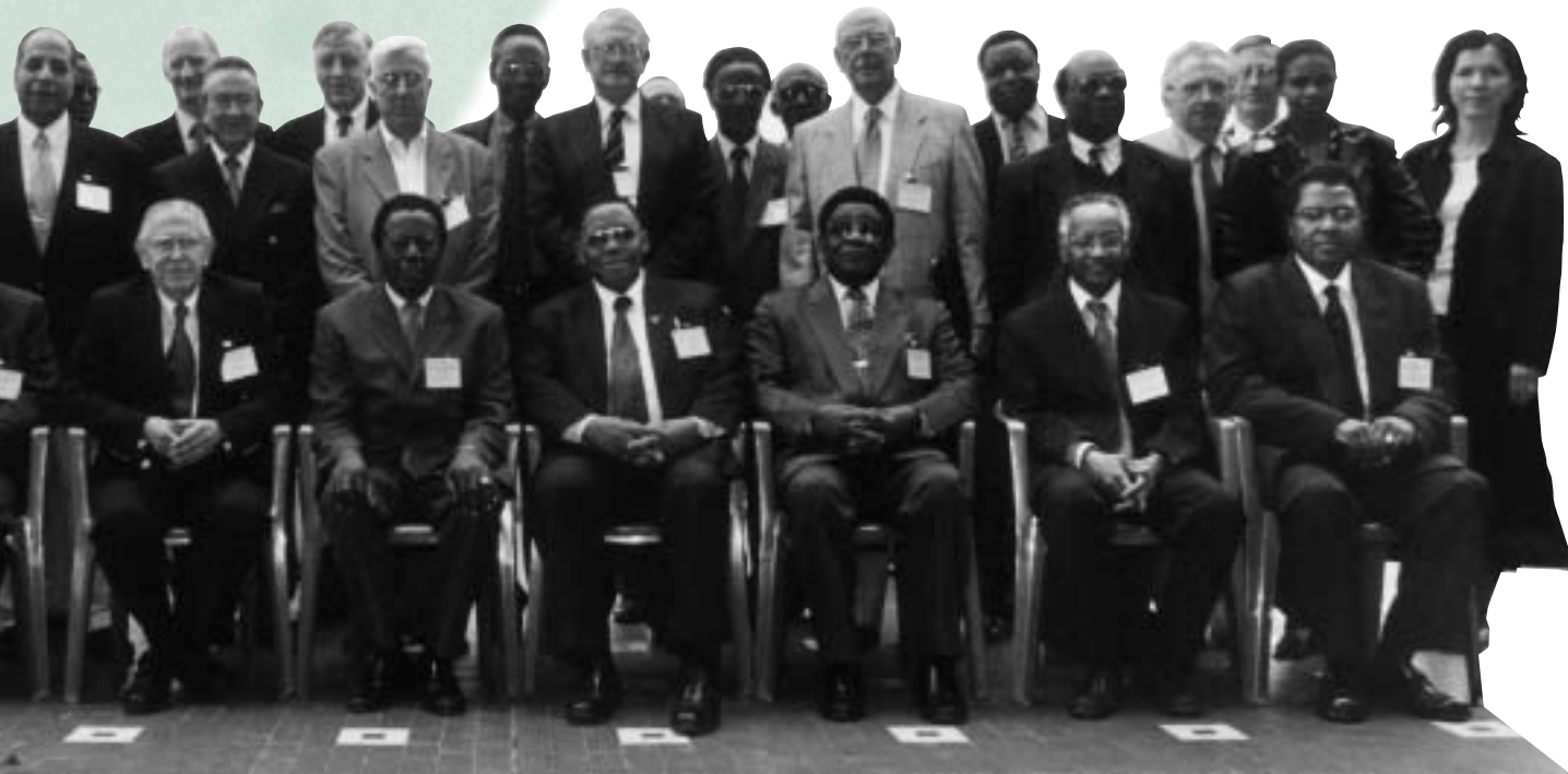
TWAS Newsletter, Vol. 13 No. 2, Apr-Jun 2001

Of the 53 nations that make up Africa, only nine have established independent merit-based science academies.