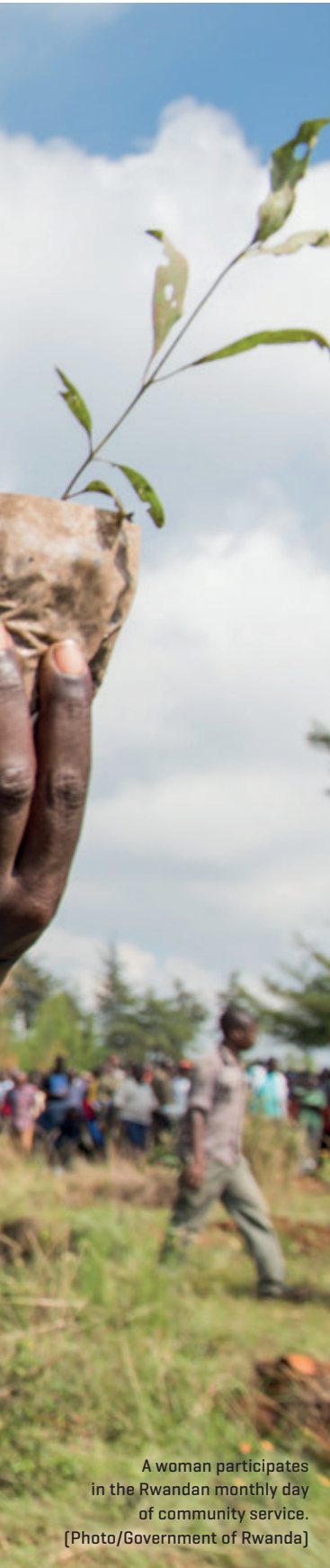
A woman participates in the Rwandan monthly day of community service.

The genocide against Rwanda's Tutsi people was initiated in 1994, when the government was under Hutu control. Kagame was the commander of the Rwandan Patriotic Front, which ended the genocide, and when a new government formed in July 1994, he was vice