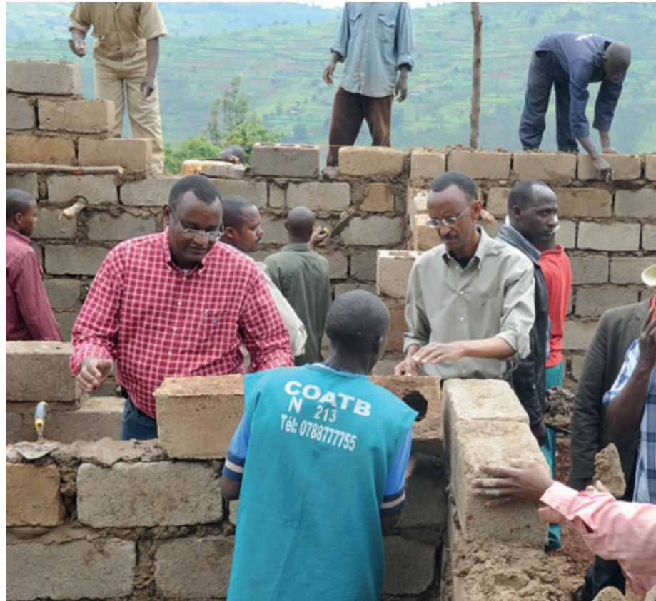
▲ Rwandan President Paul Kagame [centre] building houses for vulnerable families in Shyorongi in Kigali in 2011 during the nation’s monthly community service day.

Today, conservation and environmental science influences priority areas ranging from precision agriculture to urban design and climate change. The Ministry of Education and the Massachusetts Institute of Technology are